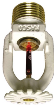
Figure 1 Pendant residential sprinkler head